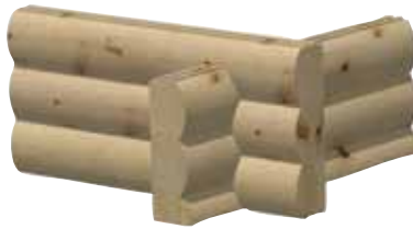
D-Log Saddle Notch Corner