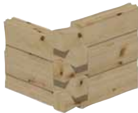
Flat on Flat Log Dovetail Corner