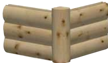
D-Log Corner Post