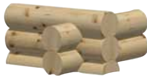
Swedish Cope Log Saddle Notch Corner