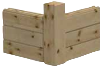
Flat on Flat Log Timber Corner Post